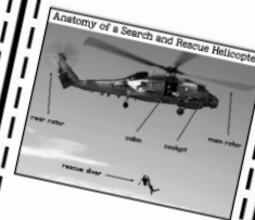
Anatomy of a Search and Rescue Helicopter