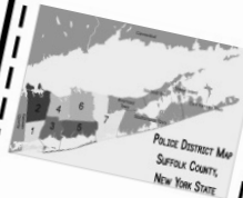
POLICE DISTRICT Map SUFFOLK COUNTY, NEW YORK STATE

tools readers use to help them understand the text