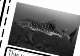
This is a whale shark.

There are four different groups of rays. Stingrays have a long, pointy spine on their tail. Skates don't have a pointy spine on their tail, and are the only rays that can give an electric shock. Electric rays make eggs. Sawfishes have a long snout with sharp teeth.